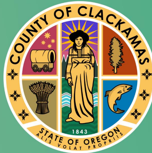
White, Gold, and Black