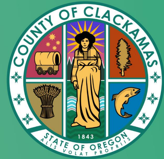
Green and White