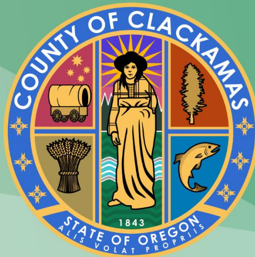
Blue, Gold, and White