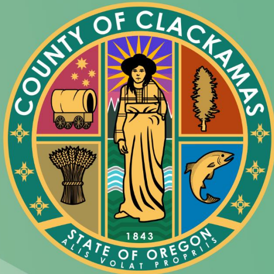
Gold, Green, and White